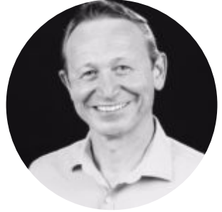
Paul Allen Statistical Process Control Control Charts